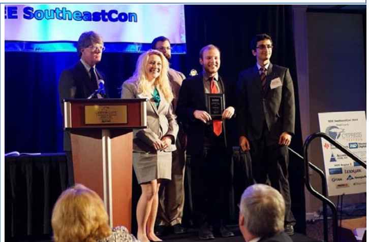
A few of our many student award winners