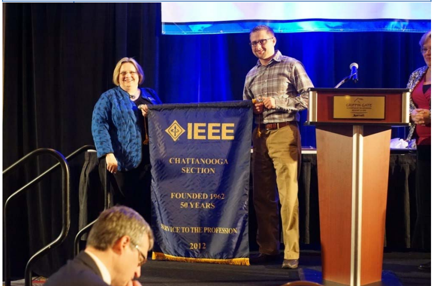
Chattanooga Section, recognized with a banner for their 50th anniversary