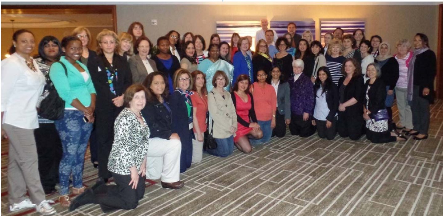
The IEEE Women In Engineering Committee attendees

Preliminary plans are to hold the second annual WIE-ILC in 2015 in San Francisco. Please stay tuned and consider allocating funds to support your section AG chair's attendance at this inspiring conference next year.