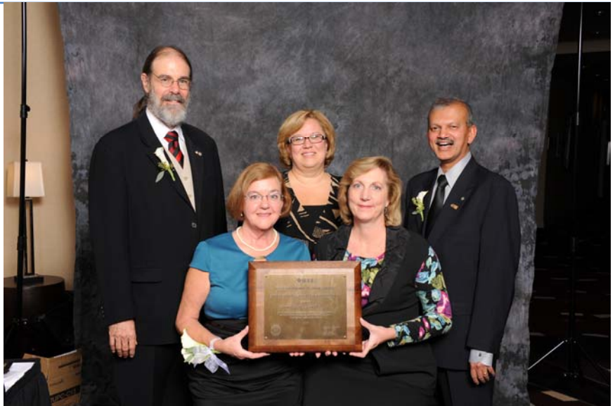
Georgia Tech Research Institute, 2013 Recipient of both the Region 3 and the EAB Employer Professional Development Awards